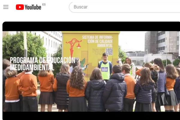
School visits ( See on Youtube )