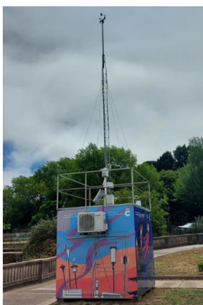
Station in Pablo Iglesias St