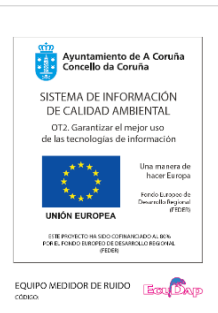
Noise measuring station labelling