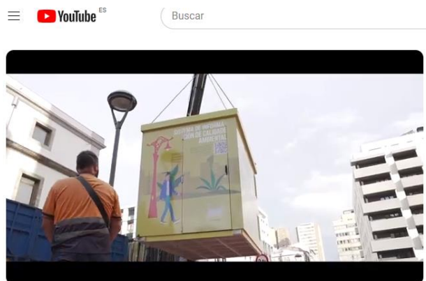
Installation of the station in Pza. Fábrica de Tabacos ( See on Youtube )

These leaflets were also distributed during school visits to the air quality monitoring stations as part of the council's environmental education programme. In turn, the visits and the installation of the station in Pza. Fábrica de Tabacos are captured in two videos that were broadcast on the works map section of the municipal website and on the municipal Youtube profile.