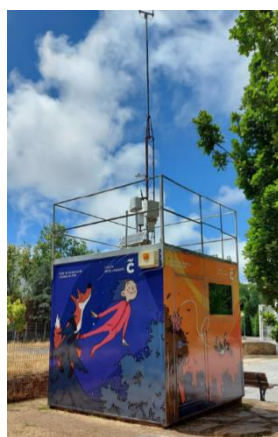
Station in Santa Margarita Park