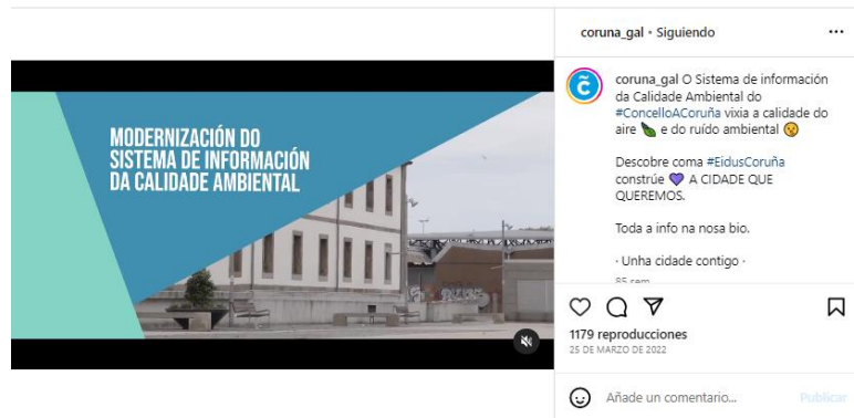
Social media campaign (Click on the image to access the publication)

Between 16 and 22 September 2021, a public information event was held as a part of European Mobility Week. Several activities were programmed in different locations across the city. One event was specifically aimed at providing an explanation of the Environmental Information System at a marquee situated in the Obelisk area. The event was reinforced with video projections and the distribution of leaflets.