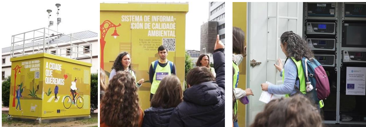
New station at Pza. Fábrica Tabacos and school visits

The stations can be visited by school groups as part of the council's environmental education programme, and the measurements are available on the website http://coruna.es/infoambiental/