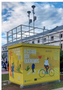
Air quality station labelling

In terms of regulatory communication, ERDF co-financing has been reported in all cases. The equipment has been labelled with the image of the European Union: