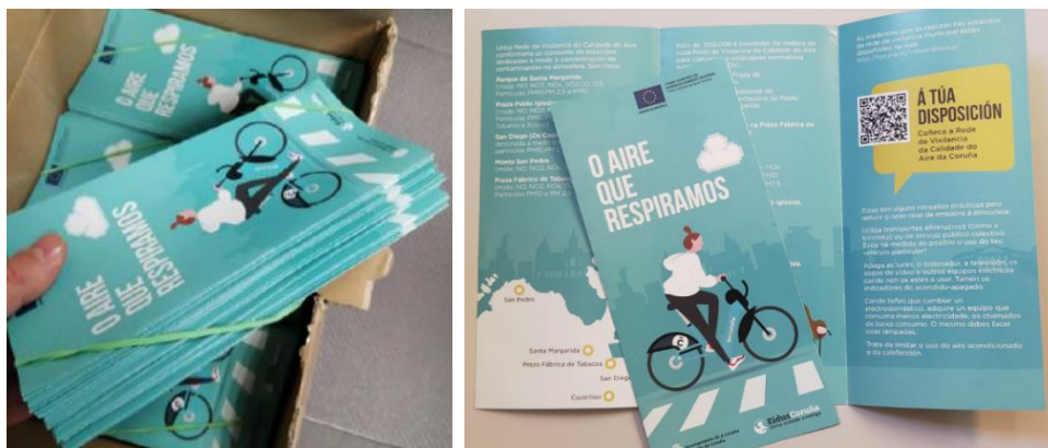
Event and leaflets